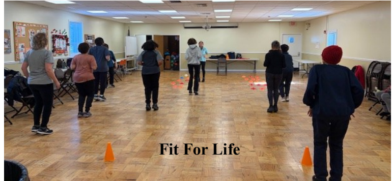
Fit For Life